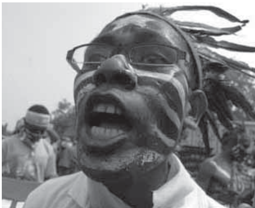
Papuan woman demonstrates for greater autonomy in Jakarta.

Even in Papua, where women have been more actively involved in informal peace talks to resolve conflict or calm tension between Papuans and the Indonesian officials (or between different elements of civil society) their presence at formal talks is limited. 56 Efforts to involve women in peace talks are mainly driven by women's groups, such as Solidaritas Perempuan Papua-SPP, (Papua Women's Solidarity).